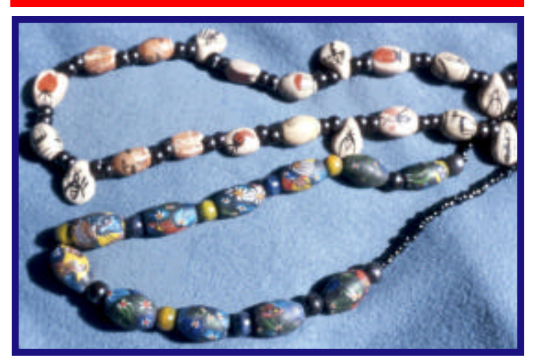
Two Strings of Beads

"Self-hardening" clay that bakes in your own oven is more expensive, but will also work in this lesson. We do not recommend plasticene because of its oily texture.