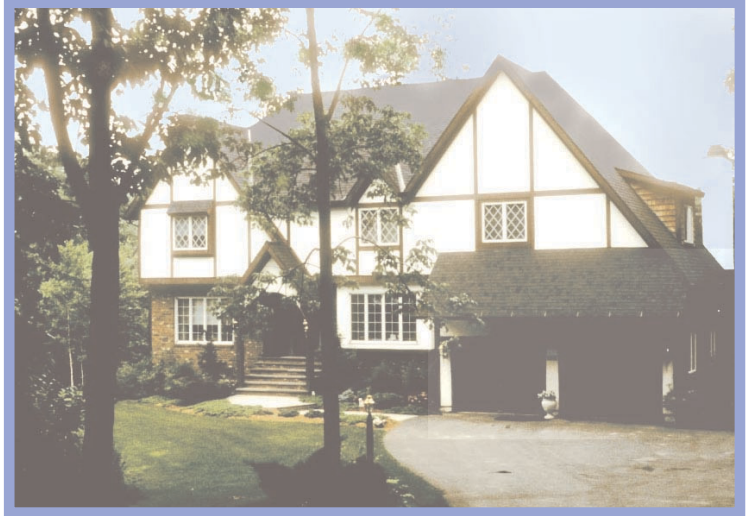
House with Gables

A NOTE TO PARENTS: Call attention to the appearance of houses, especially one-story houses with gables. Note the placement of doors and windows. Four and five-year olds may need help with the folding in this lesson, but leave the decorating to the child. Scale is not important here, only creative ideas.