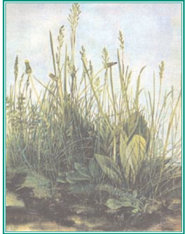
Albrecht Dürer The Great Piece of Turf 1502 Vienna, Albertina

TIPS: Gather some plant specimens such as twigs with several leaves or flowers with stems and leaves attached to draw indoors. Or, go outdoors with paper and drawing board to draw a small clump of grass, weeds or wildflowers.