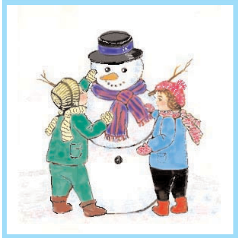
Children Making a Snowman Teacher Drawing

GETTING STARTED: What are some of the things you can do outdoors after a snowstorm. . .go sledding? Make snow angels? Build a snowman? Did you ever make a snowman three big snowballs high? What will your next snowman look like? You can pretend you are playing in the snow with friends as you make this snowman winter picture.