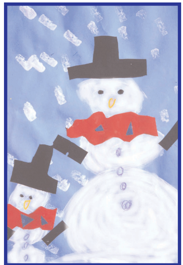
Berenice Age 5

5. While you wait for your picture to dry, wash out your brush and the paint container. Get your crayons ready. Think how you will decorate your snowman.