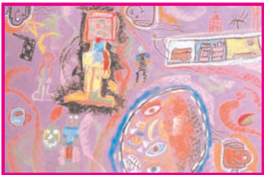
Victor Age 7

4. Stand several steps away. See if your art work needs to be adjusted by changing a color or adding another object or two to make a better balance.