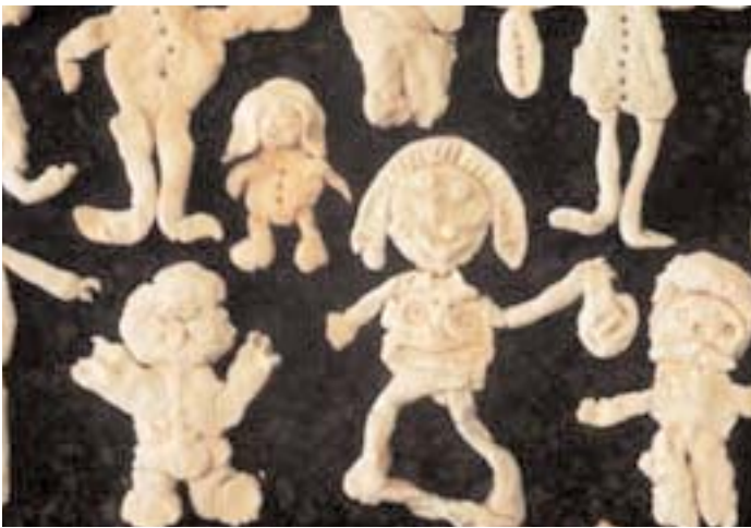
Various Students Ages 4 and 5

bas-relief (bah' ruh-leef'): a sculpture that sticks up slightly from a surface. Bas-relief is also called "low-relief."